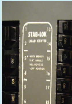
FPE Stab-Lok interior panel cover

http://www.inspect-ny.com/fpe/fpepanel.htm .