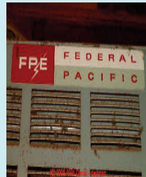
Load Center label for FPE Federal Pacific/ Stab-Lok design