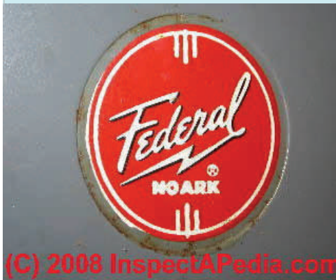
Federal NOARK exterior panel emblem

Up to 28 million Federal Pacific (FPE) Stab-Lok breaker panels were installed in U.S. homes from 1965 through the mid 1980's. Replacement FPE circuit breakers are still available on the internet and secondary markets. These breaker panels and circuit breakers have been shown to fail at alarming rates, causing a latent fire hazard.